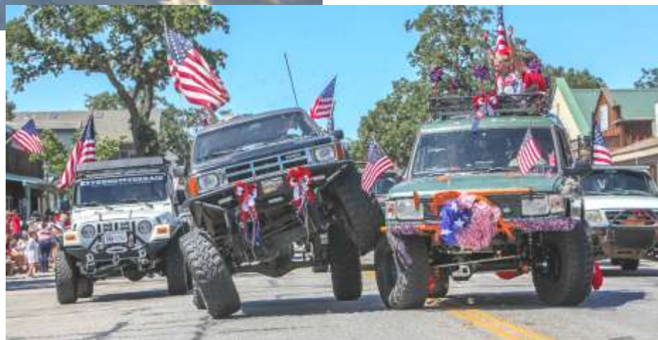
Climbing and on parade

After about an hour we returned to our starting point and everyone set about removing all of the decorations from their rigs before going on to other