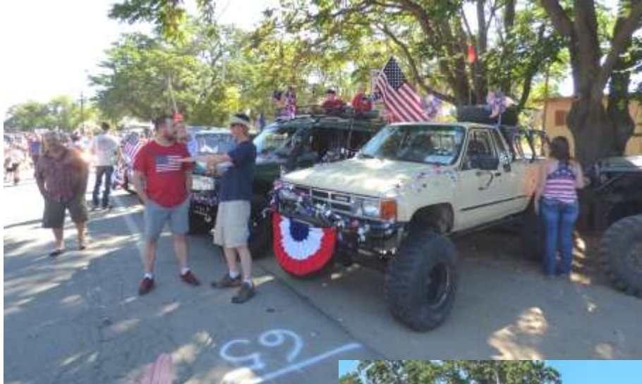
events for the 4th of July. It's always a fun event and if you haven't done it, you should give it a try next year.