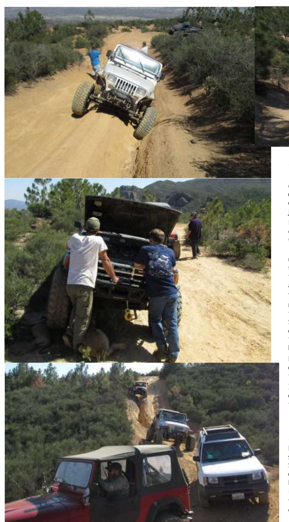
(Continued from page 2)

(Unfortunately I didn't get name) decided to help Kevin B down. Paul also decided to go down , and Casey who's jeep was acting up.