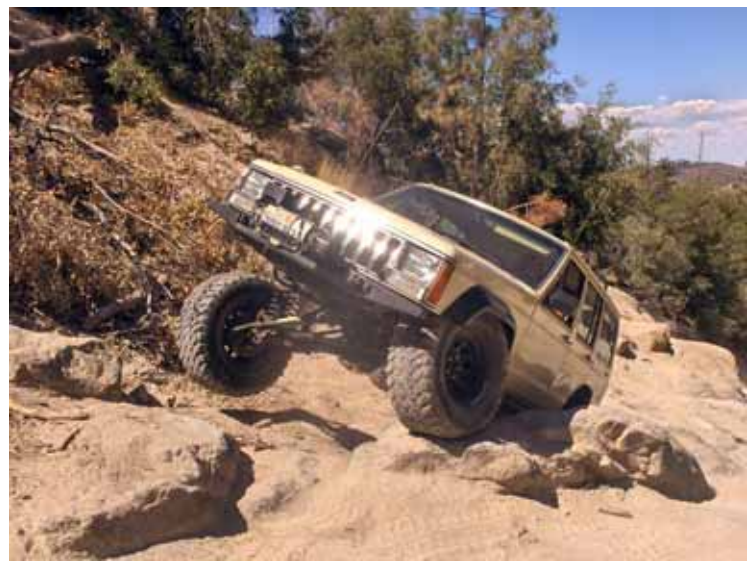
Cherokee on a roll.

All mandatory safety items are also included in the interior (CB, fire extinguisher, First-Aid kit).