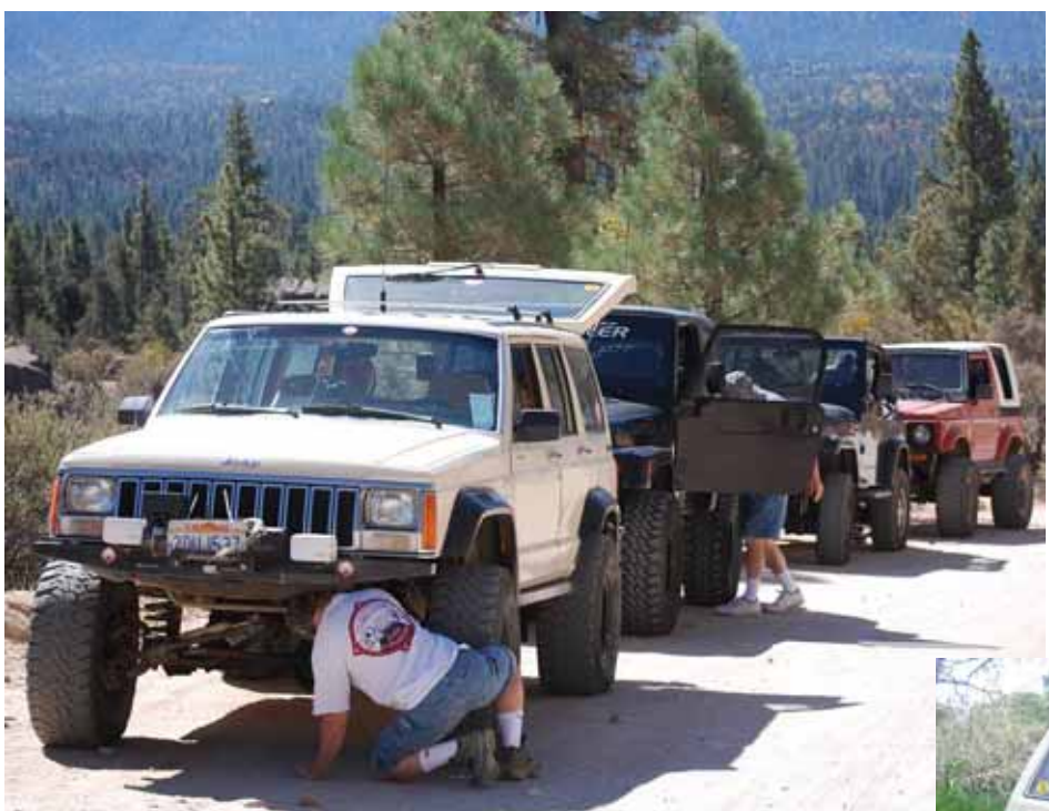
"Now there's your problem!"

works well built the way it is and if he had to do it all over again he would go with a True Radius Long Arm, 35 inch tires and 8 inches of lift.