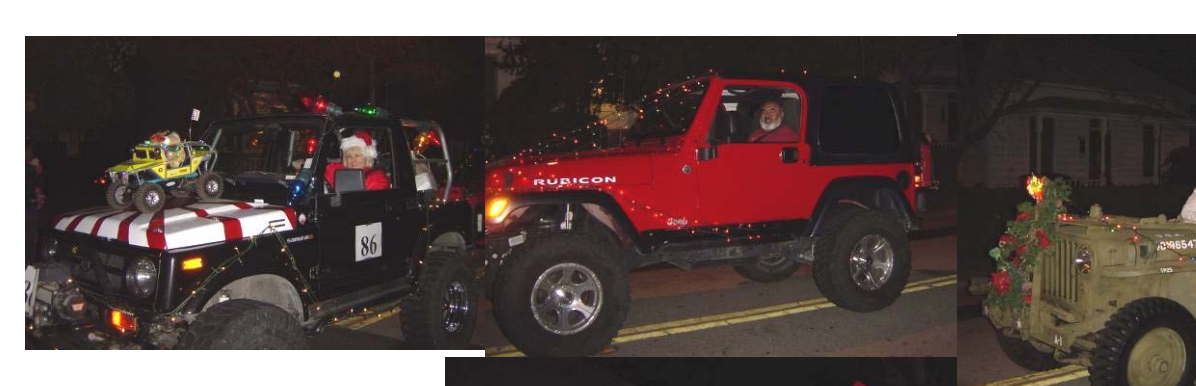
By Jim T

The participants all showed up at the prescribed time, only to find that our designated set up spot had not yet been blocked to local traffic.