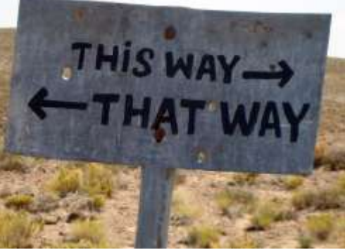
Sign Sign found in Garfield Flats.

Nearly 66,500 acres are public land. Among the sights worth visiting are Teels Marsh and the ghost towns of Marietta and Candelaria. (Marietta has a few hardy souls in it yet so it might not really qualify as a ghost town.) Also located along the western edge of Mineral County is the Excelsior Moun-