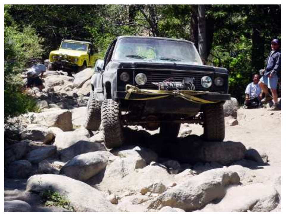
Don't lose the vehicle behind — Keep track of the vehicle behind you.

Where there are multiple obstacles, drop back farther to get a better perspective.